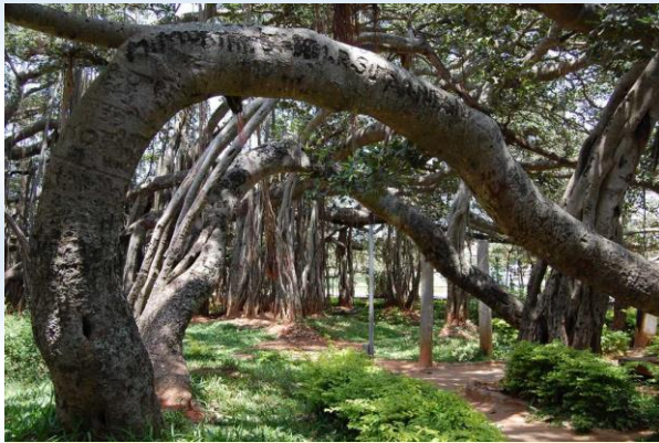
Big Banyan Tree