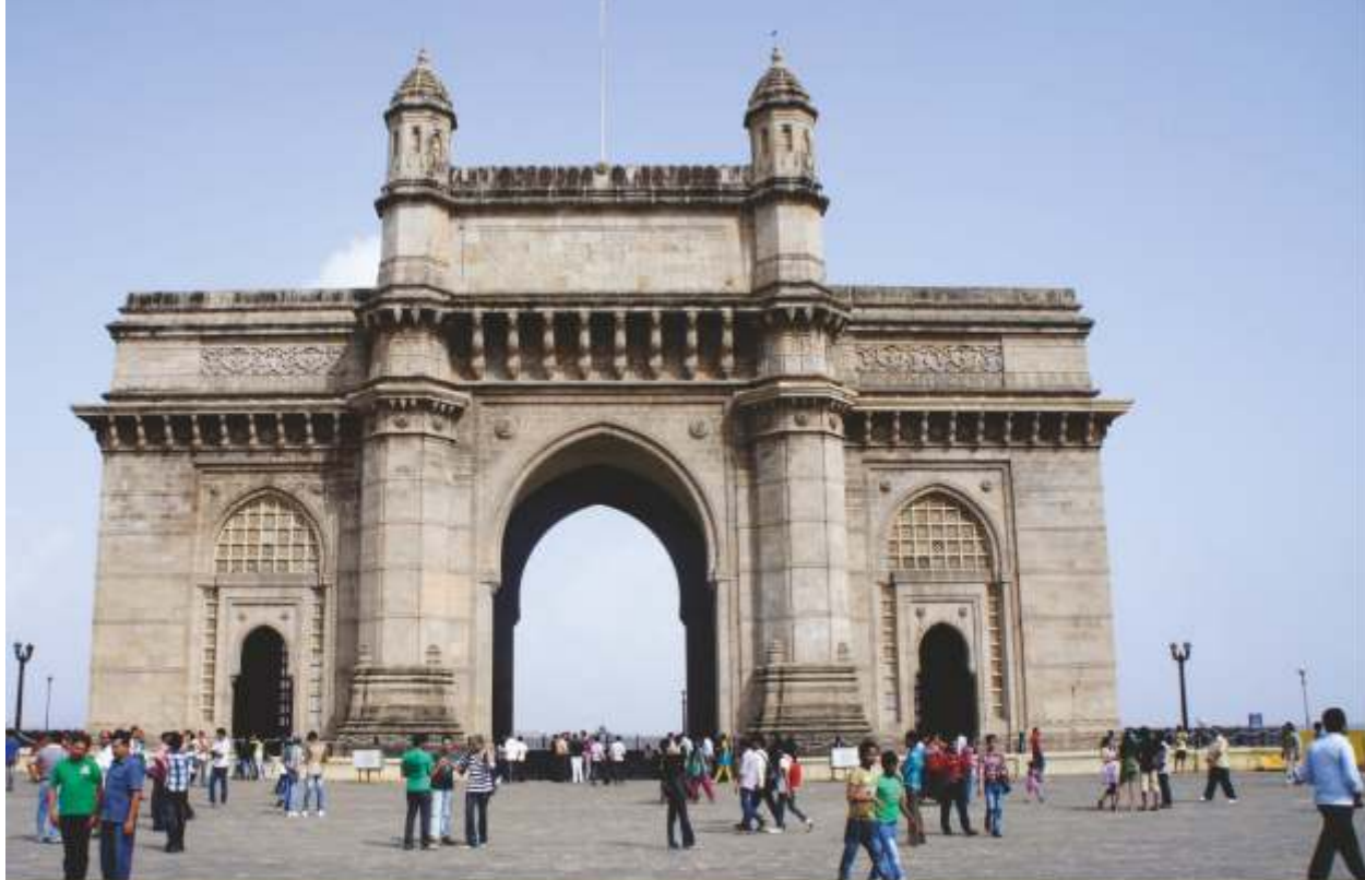
Gateway of India