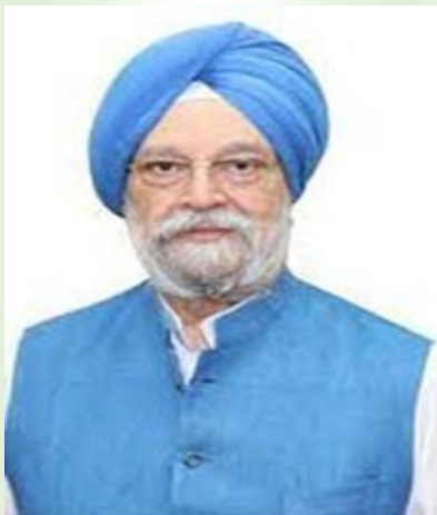
Shri Hardeep Singh Puri Hon'ble Minister of Petroleum and Natural Gas & Minister of Housing and Urban Affairs

-Shri Narendra Modi Hon'ble Prime Minister of India