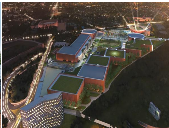
International Exhibition Cum Convention Centre (IECC), Pragati Maidan, New Delhi