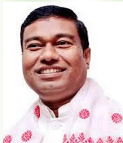
Shri Rameswar Teli Hon'ble Minister of State Petroleum and Natural Gas & Labour and Employment